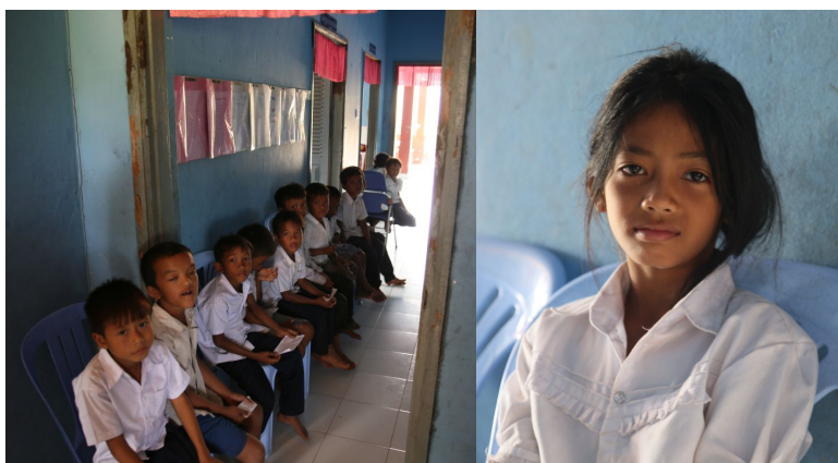
Patiently waiting young patients