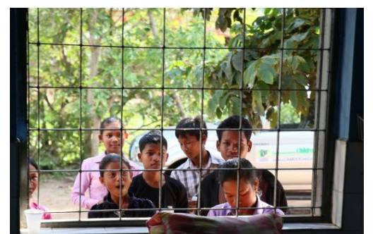
Interested spectators outside