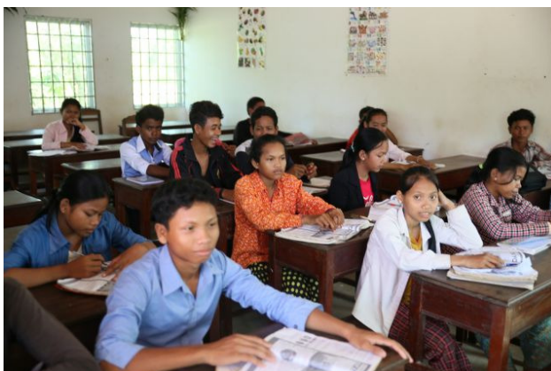
Learning English in the new CTC

In the near future also our computer courses will be given in the new building. Since we have access to the electric power network, we can easily extend the number of computers.