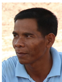
Sokh, Concierge CTC