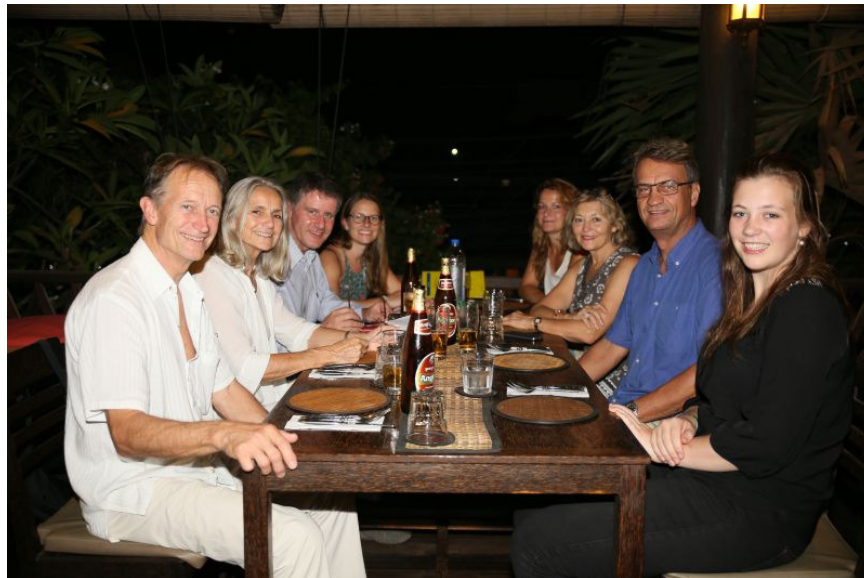
The project team celebrating the result with a dinner

In the future we intend to carry out this dental health care project once a year.