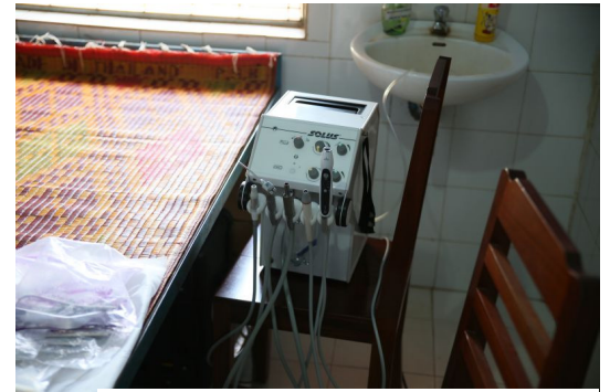
Mobile unit „Solus mobil“

The instruments were acquired from Dental Health International Netherlands (DHIN), for a nice 'project price'.