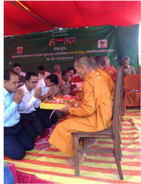
Buddhist monks bless the CTC