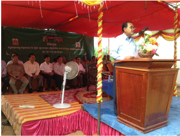
The Puok District Governor addresses his opening speech

At the occasion of the official opening of the new CTC in Roeul a big party was organized.